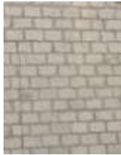
Stone/dressing that does not match the vernacular: (clockwise from top left) jumping stones; rock faced; white limestone; un-coursed random rubble

The presence of render in the village is generally a characteristic of houses of the first half of the twentieth century, where it exemplifies the period style of that time. Where render has been introduced to traditional buildings at a later date it can be a discordant feature. The use of exposed brick in the village is limited to the Victorian Red House and the late 1930s bungalows Nun Bank and South View, and although good