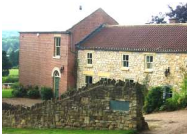
The Red House: Welsh slate and pantile

Welsh slate became cheaper than pantiles and as a result some buildings were built and re-roofed in the later-nineteenth century using slate. Twentieth-century buildings have mostly utilised clay tiles for roofing, in styles characteristic of their age: plain clay tiles on the Edwardian Cliff House and Crag Cottage; roman pantiles on the 1920s Old Post Office and the 1930s bungalows. These clay tiles have weathered attractively to harmonise with