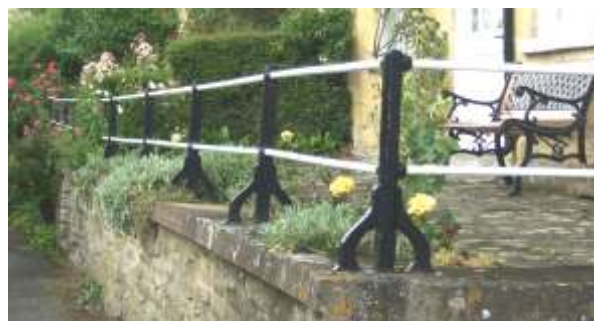
Cast iron railings along The Terrace

The use of boundary treatments such as native hedging and cast iron rails, such as those seen at the start of The Terrace, in addition to the traditional stone wall can provide interest and privacy, and where they exist they should be preserved. In particular, the planting of native hedges is desirable in order to strengthen boundaries and help to integrate more recent development. One or two retaining walls have been constructed during the twentieth century using non-native hard gritstones and to an overwhelming height. These have a severe appearance that is not keeping with the Oswaldkirk aesthetic.