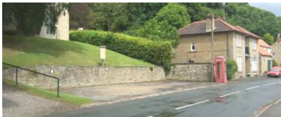
Loss of traditional boundaries and areas of hard standing can be detrimental to the street scene

Oswaldkirk has avoided the road markings and highways structures associated with traffic restrictions, however parking and traffic is a concern to some village residents. Any future proposals for traffic restrictions should be sensitively designed to avoid markings, signage, barriers or lighting that would be detrimental to the rural character of the Area, and the local planning authorities would wish to be involved in discussions between parties at an early stage to seek to mitigate any negative impacts of such installations. The creation of additional off-