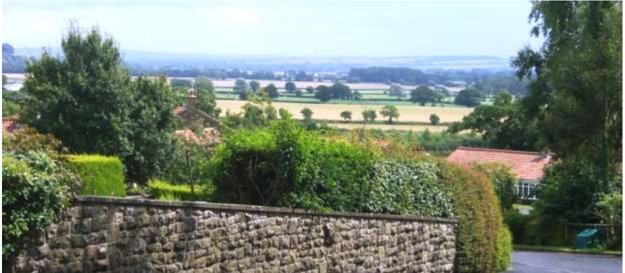
Extensive views over the Gap from the centre of Main Street over the roofs of later development

From Oswaldkirk Bank the views of Main Street are framed by overhanging tree branches and the dominant impression of the village is one of verdant foliage, hedgerows and trees, a theme continued as the B1363 continues towards Gilling between magnificent tall beech hedges forming the boundaries of The Red House, Holly Tree House, Ledbrooke House and Havoc Hall (Martins). However, it is notable that nineteenth and twentieth century photographs show less dense tree coverage, which can impede views if not actively managed.