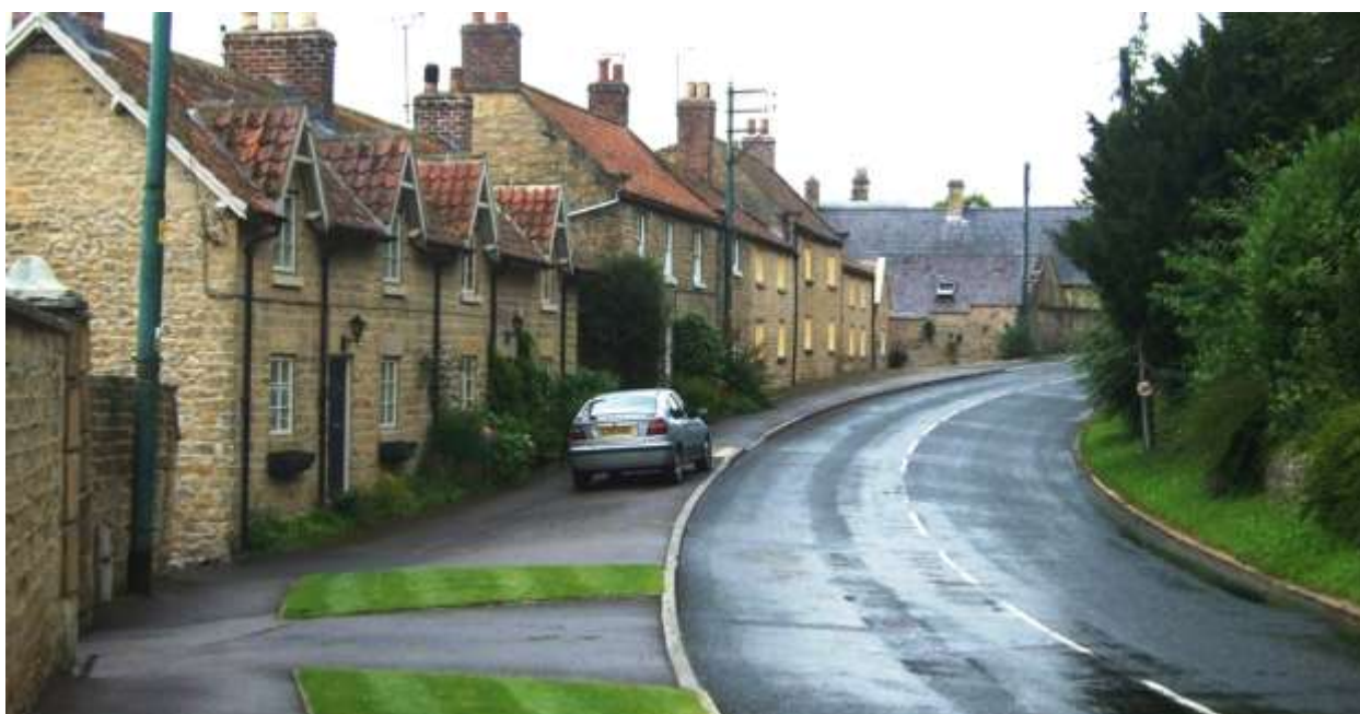
Western end of Main Street

9.1 Main Street has a strong built form towards its eastern and western ends, with the central part of the street in-filled by later development which has little relation to the historical built character of the village. To the eastern and western ends, the often densely built frontages of attached buildings, the close positioning of buildings to the highway and the elevated plots and high retaining walls to the north side, a consequence of the rising hillside, together create a dense streetscape form. Development to the northern side is more sporadic than on the south side due probably to the rising ground and buildings are generally detached and occupy more substantial plots, providing large open gaps in the streetscene which are well planted and allow a close visual connection with the wooded hillside.