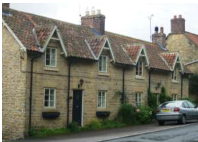
Swiss Cottages, Main Street: gabled half dormers typical of Oswaldkirk's paired Victorian cottages

Vernacular roof forms are generally of simple dual pitch construction, with only the grandest buildings having hipped roofs. In the first half of the twentieth century, hipped roofs became common, but most development since then has reverted to the simpler form. Half-dormer windows and small gables are a characteristic feature within the Conservation Area where they are original to the houses. Several paired Victorian and Edwardian cottages in Main Street and The Terrace display gabled half-