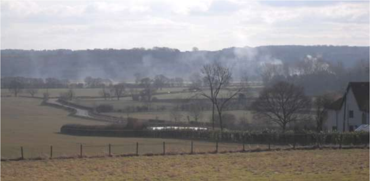
Trees contribute to parkland-style setting

The National Park Authority's Design Guide Part 3: Trees and Landscape SPD contains detailed guidance and advice on the retention and protection of good quality trees and trees of amenity value, planting additional trees where appropriate and providing well-designed, sustainable landscape schemes. It provides lists of suitable native shrub, tree and woodland planting by character area, and guidance on hedgerow planting.