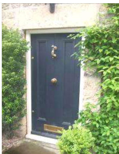
Quality traditional joinery

Where historic joinery survives, every effort should be made to repair rather than replace it, particularly with modern fittings of a different design to the original. The Building Conservation Officer may be able to suggest contractors who specialise in the restoration of traditional features such as windows and doors, as well as sources of specialist advice on more unusual fittings such as metal framed or leaded windows. The use of uPVC on buildings that make a positive contribution to the character of the Area is not appropriate due to its unsympathetic stark appearance and failure to replicate traditional joinery details.