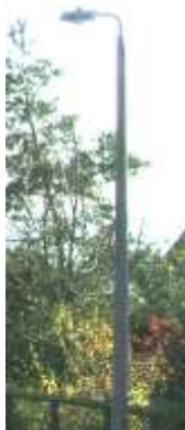
Concrete street light in Manor Close

The absence of street lighting in most of the Conservation Area adds to the rural character of the village and minimises street clutter. The provision of further street lighting on lighting columns should be avoided in order to maintain the rural character of the Conservation Area. Any future proposals for street lighting should consider mounting lights on the existing electricity poles, which are the original metal poles donated by Colonel Benson (see 19.12); on the telephone poles; or on walls and buildings to avoid further street clutter. Lighting on new developments should be used discreetly where required to avoid lighting an unnecessarily large area. Fittings should be carefully chosen to provide the minimum light required for safe access. The use of floodlights for extensive illumination, particularly where this extends beyond property boundaries, is