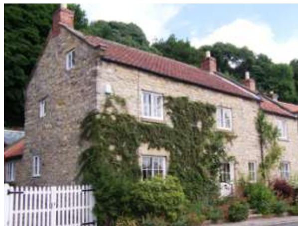
Ivy Cottage, Main Street

including Abbey House, Ivy Cottage and Manor Farm. A number of former farm buildings, some converted to other uses, survive along the length and to the south of Main Street that are important reminders of the village's agricultural past, notably buildings adjacent to Manor Farm, the Malt Shovel, Albro House (garage), and Oswaldkirk Hall/Hall Farm. The ancillary buildings are characterised by generally being