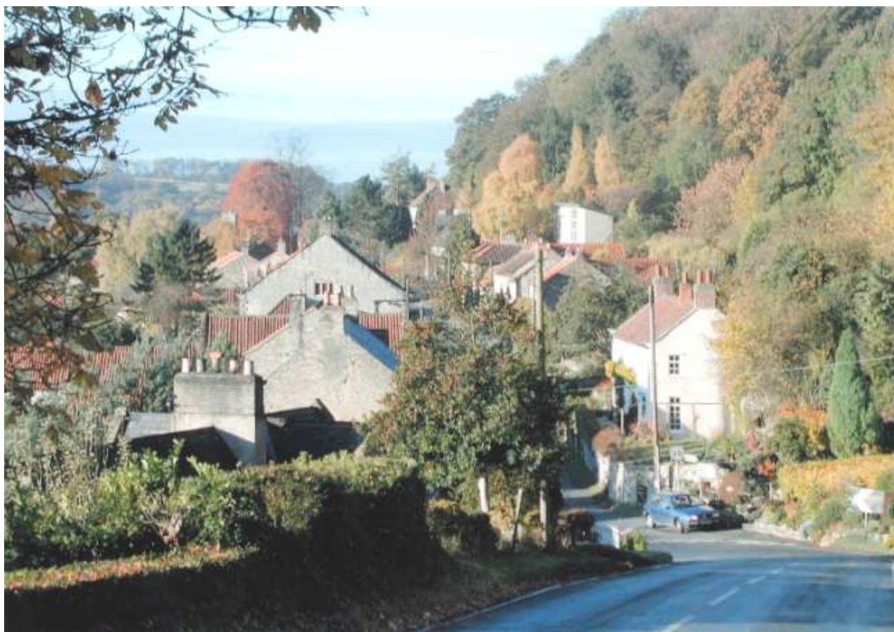
1 Main Street from Oswaldkirk Bank