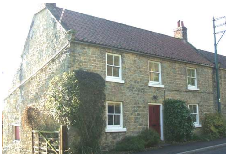
Abbey House, Main Street: coursed rubble to gable, squared stone to front

The mid-twentieth century saw a reversion to the use of limestone rubble in Oswaldkirk, making buildings such as Council Houses and The Steps fit harmoniously into the historic streetscene. More recently the use of stonework has been less successful where stone has not been laid to regular courses; where it incorporates “jumping” square stones that occupy multiple courses; or where hard limestones have been used that are