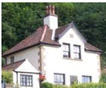
Crag Cottage, Main Street: central chimney stack

Chimney stacks make an important contribution to the roofscape when viewed from within and outside the Conservation Area and provide definition to the varied building forms. Their size, material, design or absence helps to delineate the function and status of the building, and they can be impressive architectural features in their own right for example in the cases of Crag Cottage and The White House, where the chimney designs are integral to their respective architectural characters. Often overlooked in modern developments, where chimneys are absent or diminutive in height and scale, the provision of stacks can help to integrate development providing close attention is paid to the detail of the design. Chimney stacks are typically of handmade brick or stone.