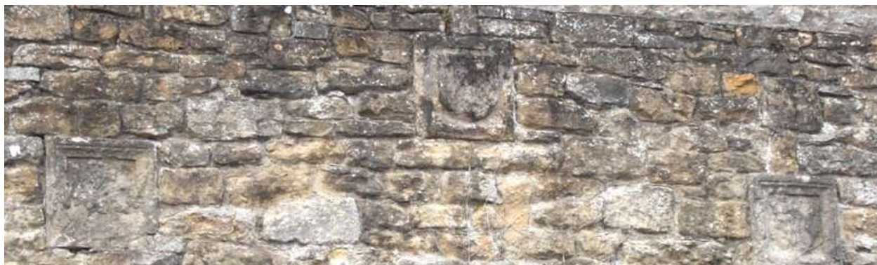
The three shields of the Pickering family from the former manor house

The three shields of the Pickering family were re-incorporated into the retaining wall beside the road opposite the church when it was reconstructed about ten feet further north to facilitate road widening in the 1930s. In 1674 the manor was sold to William Moore who was responsible for demolishing the old manor house and building (as successive manor houses) the present Malt Shovel Inn and the Hall. Only St Oswald's Church survives from before the seventeenth century.