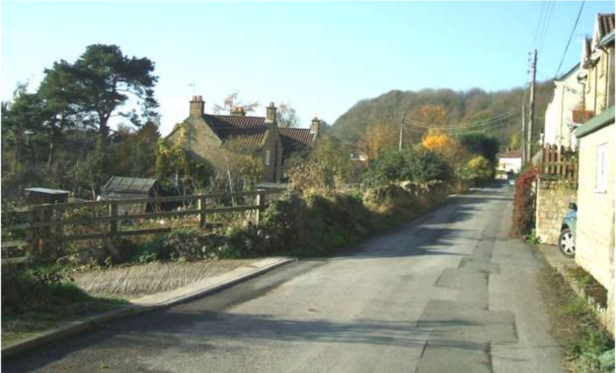
The Terrace: elevated terraces to the north face wide gaps between twentieth century buildings to the south. In places, boundaries have been eroded.

10.6 Oswaldkirk Bank was mostly developed in the early twentieth century, with the building of Crag Cottage, Cliff House (1919) and The Bungalow (1920s), buildings that exemplify a change in the way of life from that of an exclusively agricultural community that inhabited farms and cottages to a community that attracted richer 'incomers' who introduced fashionable, non-vernacular building styles and constructed houses that were elevated to take advantage of views and light. Bank House (Sunnybank) is an earlier, Victorian, house that was formerly the police house, and it retains two cells which are cut into the rocky cliff side.