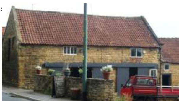
Malt Shovel barns

ited at right angles to Main Street, in contrast to houses which generally present their principal elevation to the road. Smaller historic structures visible from public vantage points also add character to the Area, such as those at Bank Cottage, The White House and Abbey House, as well as the K6 model public telephone box,