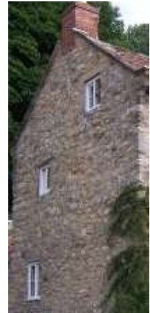
Random rubble stone gable to vernacular building

The majority of later-nineteenth and twentieth-century buildings are constructed from more formal squared locally-quarried sandstone blocks. Dressings (for example cills, lintels and quoins) are most commonly of sandstone due to its workability and availability in large blocks. Historically, squared stone is always laid to course, usually employing a range of course heights to make the best use of the stone available. Common practice was to use squared stone to the front elevation and rubble to the gables and rear elevations, as at Swiss Cottages or Abbey House.