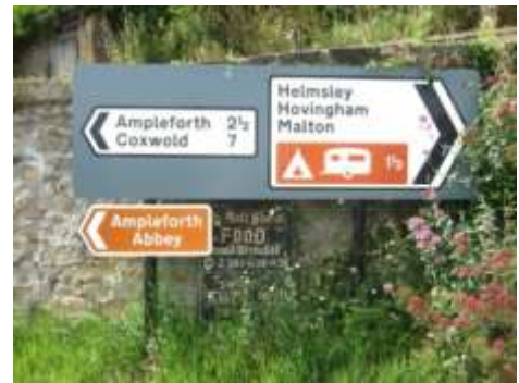
Incremental addition of signage creates visual clutter

Highways Authority. Possibilities may include reintroducing reproduction black and white cast iron 'fingerposts', particularly if photographs of the originals can be found. Street name signs should be fixed onto existing walls where possible rather than mounted on low poles, which are more akin to suburban cul-de-sacs.