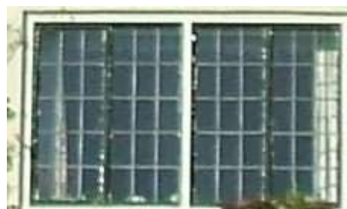
Original leaded lights in metal frames

Paint colours or other finish should be chosen with care to be appropriate to the age and style of property and the material of the fixture. An off-white is often more flattering to a building than brilliant white, but where more unusual quality fixtures survive, for example oak windows or metal-framed and leaded casements, they should be retained and treated as originally intended. The replacement of painted joinery with stained should be avoided as stain is not a traditional finish. In some circumstances, for example on