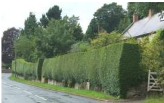
Impressive privet hedging at The Manor House

Hedges of native species and stone boundary walls bordering the road are important features that provide definition to the village streets. Where these have been removed, for example to create parking areas or widen accesses, or supplemented with timber fencing, this has eroded