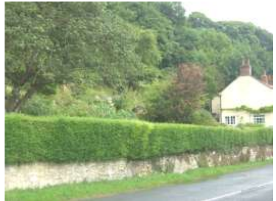
Attractive gardens beneath the Hag

To the south of Main Street, glimpses of the surrounding countryside are seen between and over the buildings which provide important context to the village and accentuate its relationship with the countryside beyond the built up area.