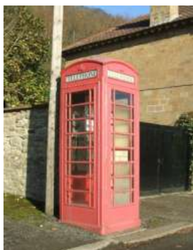
K6 model telephone box

designed by Sir Giles Gilbert Scott in 1935 to commemorate the Silver Jubilee of King George V (this example dates from between 1935 and 1955).