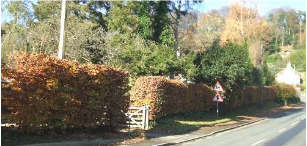
Verdant hedging boundaries characterise the Conservation Area

Boundary treatments should be carefully selected to maintain the rural appearance of the village. Native species hedging (such as beech) and stone walls (using local stone bedded dry or in lime mortar) are the most visually important boundary forms in the village, but additional suitable treatments include low timber picket gates and fences; cast iron fencing to match that seen on The Terrace; or simple painted steel 'estate' type fencing. Designs should generally be plain and low to ensure that the fencing does not overpower the host property, impair visual permeability or detract from the rural setting of the village. Further hedge planting could help to strengthen boundaries within the street scene. The further erosion of characteristic boundary treatments will be resisted where Planning Permission is required.