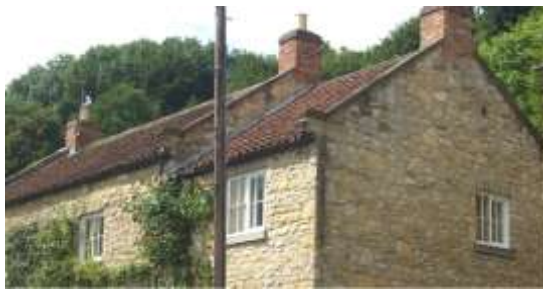
Stone water-tabling, kneelers and cast iron rainwater goods

Traditional and vernacular buildings are characterised by stone coping at the gable often with kneelers terminating at the eaves. Half-round guttering is supported by metal brackets or spikes fixed directly to the stonework without fascia boards. Victorian cottage developments and later buildings omit stone copings in favour of simple barge boarding. The rafter ends may be left exposed under overhanging eaves. Original rainwater goods are always of robust cast iron. The original style of detailing should always be respected.