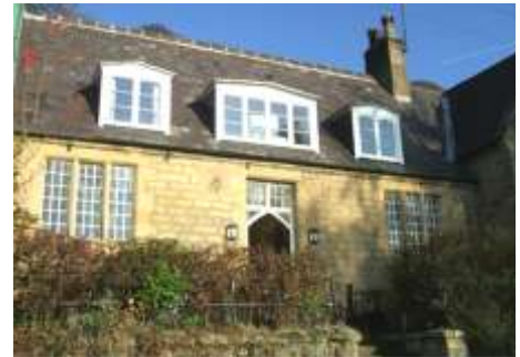
Former village school, now Southlands

10.5 The Terrace , which forms the eastern third of the village, has a more cohesive architectural and historic character that can be attributed to the fact that most of the buildings on the northern side date from the second half of the nineteenth century. The principal building type is short terraces and semi-detached properties (several now amalgamated to form single dwellings). Each block is individual in detail but the regular building line, related height and scale and generally harmonious palate of materials give the north side of the Terrace a consistency that contrasts with the more organic development of the rest of the village. Especially notable in terms of quality of design and construction are the three cottages at the start of The Terrace – Laurel Cottage, Southlands and School House – which occupy the building originally built in 1854 as the village school and schoolmaster’s house. The building is likely to have been designed by an architect although his identity has not been established. The dormer windows may have been inserted when the school was converted to residential use following closure in 1908. As on Main Street, a small number of historic ancillary buildings add to the built character of the area, such as the original outbuilding to Pavilion House.