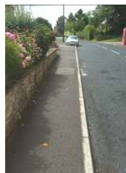
Concrete kerbing and tarmac footpaths erode rural character

A footpath runs the length of Main Street to the southern side and continues along the western side of the Gilling road providing pedestrian access to the play area. The use of standard materials, black tarmac and concrete kerbs without a softening verge strip creates an engineered, urban appearance which contrasts with the natural edging to the north of Main Street. The extension or widening of tarmac surfaces, particularly at the expense of areas of grass verge, would be detrimental to the appearance of the Area. Additional concrete kerbing should be avoided in favour of a verge or, if essential, more rustic natural stone kerbs.