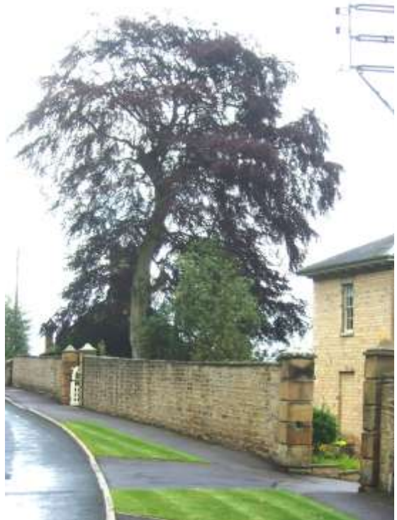
Magnificent copper beech tree provides visual punctuation in the street scene

Apple trees can be seen in many of the gardens to the north of the Conservation Area, taking advantage of the south facing aspect of the village. Historic maps (Map B, Appendix 1) show that orchards were once a common feature in the gardens of the larger properties in Oswaldkirk, and are a characteristic of the area more widely which should be perpetuated where possible.